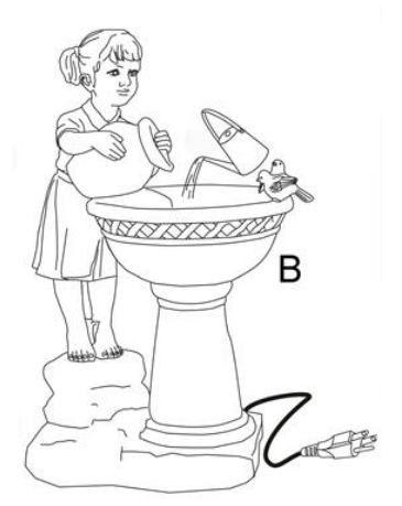
Step 4: Finally, connect the plug of pump (E) to a GFCI outlet.

WARNING: Always disconnect the pump (E) before placing your hands in the water.